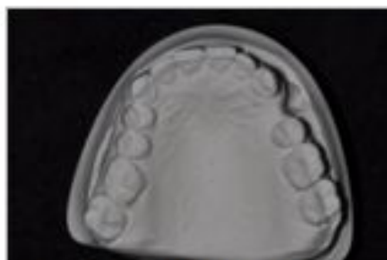
Maxillary cast occlusal view F/32, solid color background