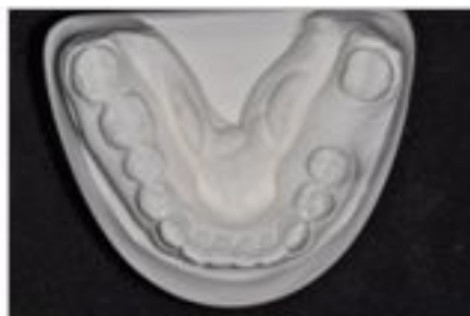
Mandibular cast occlusal view F/32, solid color background

A photo utilizing one of these Condylar Positioning Techniques is recommended: