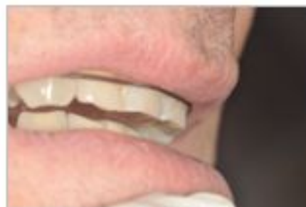
Kois Deprogrammer At Delivery