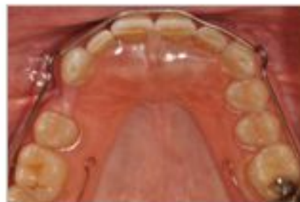
Kois Deprogrammer After Adjustment