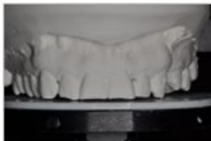
Maxillary cast on Kois Analyzer F/32, solid color background